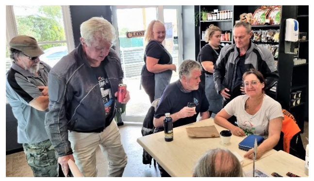
Wistow for morning tea