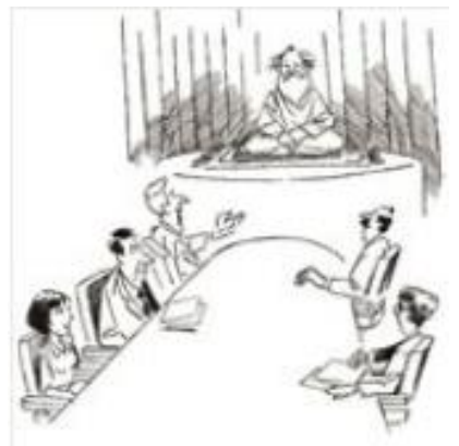
"Guide us, oh Webmaster."